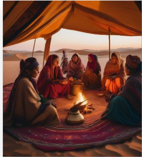
Enlarging the space in our tents to have synodal conversations.

There was a time when pilgrims walked without maps, following the stars. On our pilgrimage we identify with the people who look to signs in the sky as a reference to where we are going. The Society is evolving, and we need to discover how the Spirit of God is leading us into the future. With this intention, we listened to the reports of the General Council and the Treasurer General, we considered the Congregational Study and the synthesis of the reports from the provinces. In these days, we also listened to presentations from the International Planning Commission and the International Commissions on JPIC, Education, Volunteers and Vocations. All these presentations and reports helped us to be aware of how much the Society has evolved over the last eight years and how much is still to be done!