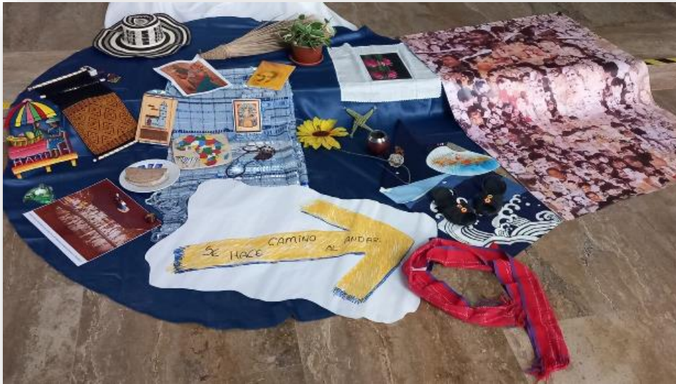
Symbols offered by each province to travel the journey during Chapter 2024.

If you could see the journey whole, you may never undertake it, might never dare the first step that propels you from the place you have known towards the place you know not.