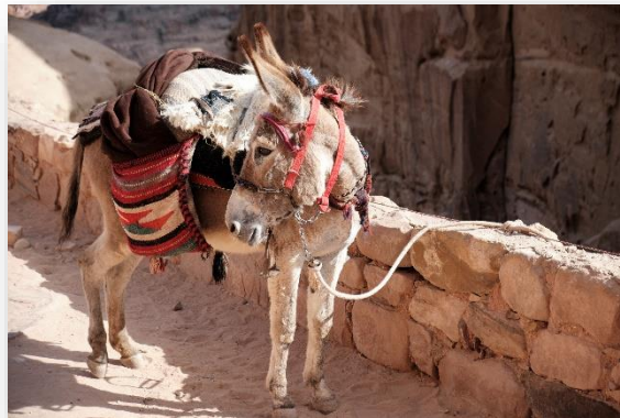
"Untie it. The Lord needs it."

This gospel passage invited us to be open to the call to serve. It was in this context and atmosphere of personal and communal discernment that the process for the election of the Superior General began.