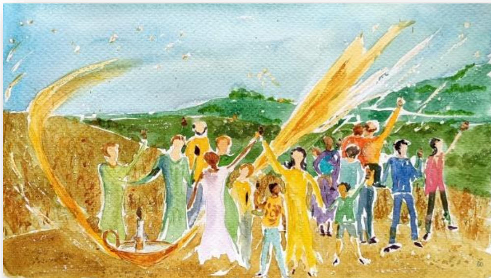
"Transmission". Thinking about the transmission of the Chapter, as well as our charism. A call for each of us to become this flame that is transmitted from the flame of Sophie's candle.

Our deepened understanding of charism and identity inspires us to live our shared mission through revitalized governance structures and putting our resources in common.