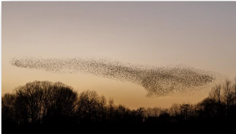
A flock of starlings. Starlings are birds that move in the same direction as a whole, contracting and expanding, rising, descending and changing direction while maintaining a compact shape.

The journey we followed prepared our hearts as a community of believers and women of hope so that we could confirm the decision made by the Assembly of Provincials in Malaga in December 2022, to create eight New Provinces