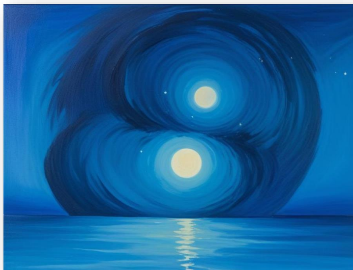
Making room for grace by embracing our vulnerabilities and diving deep into our being.

During these days, we talked about our losses and the grief that this causes us. We will need to mourn what we let go of to create space for new life.